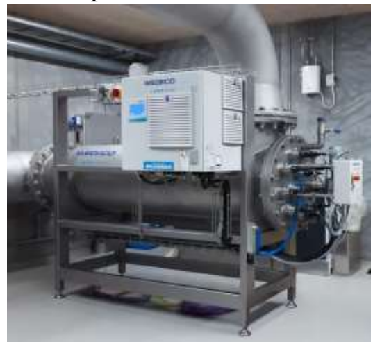
Pic.3 UV sterilizer

Pathogenic microorganisms can harm the human body only if they multiply in the body; when water is disinfected with ultraviolet light, this ability is lost and, as a result, any negative effect of microorganisms is excluded.