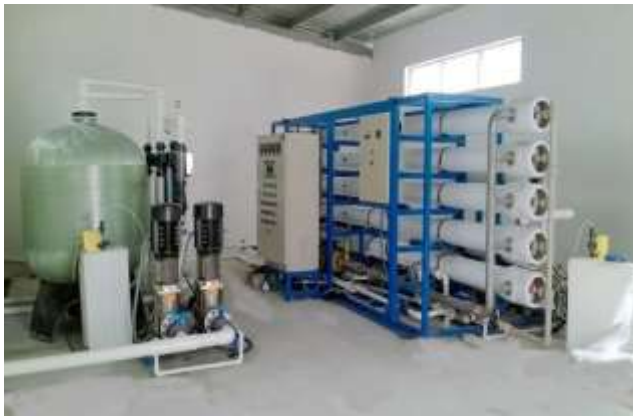
Pic.2 Reverse Osmosis Cleaning Equipment

Reverse osmosis technology is the most modern method that uses the principle of water molecules passing through a semi-permeable membrane under the influence of external pressure. With the help of the reverse osmosis process, it is possible to get rid of 98% of impurities dissolved in water (in industrial installations, the figure can reach 100%).