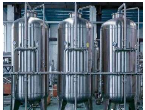
Pic.1 Water filter system

Used to remove calcium and magnesium ions from water, thereby softening the water.